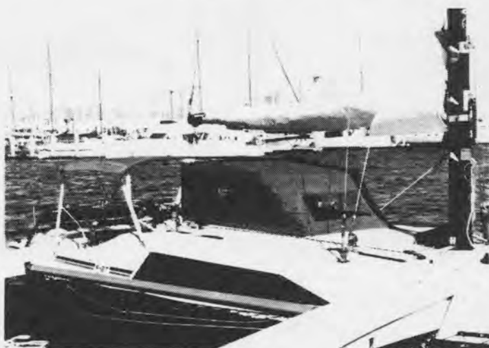
The Pop-top cover has been added here, for fully enclosed standing headroom while overnighting.