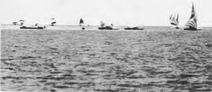
Some of the action at the 1985 Australian National titles. Plan early for 1988

The club itself, a division of the Moreton Bay Boat Club, has excellent facilities, with wide shallow all tide boat ramps, step ashore mooring for a full fleet of boats on the club pontoons, hard stand and parking. The clubhouse is well appointed, and of similar size to our last venue, the Bundaberg Blue Water Club, including full bar facilities, and a bilge area for half drowned sailors. A planned second story and observation deck to be completed before Easter 1988, would have to make this club, apart from R.Q., the best on the Bay.