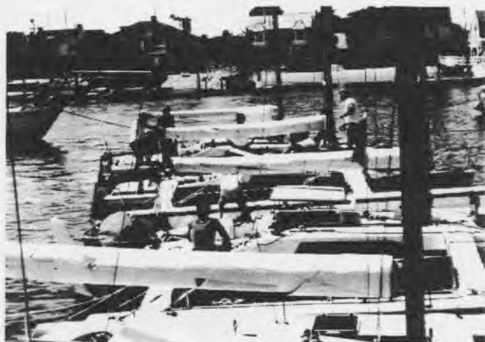
The F-27 'raft-up' prior to the start of the 1987 Newport-Ensenada Race.

At day break we found ourselves once again surrounded by boats. All the boats had their lightest weight spinnakers up and were slowly drifting south. By this time we chose to drift with the swells toward shore, thereby seeing an occasional knot of boat speed. Around 6:00 a.m. the wind came back, light but at least perceptible. The half ounce chute went up and off we were at 5 to 7 knots.