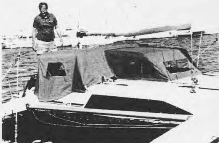
The Cockpit Cabin has now been added, and this fully encloses the cockpit area, to greatly increase sheltered area for overnighting. A zip up door is located on the aft side.