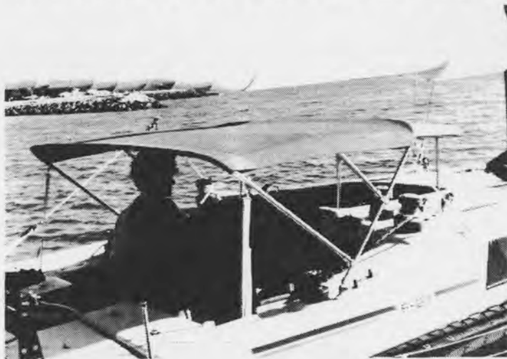
This photo shows the Bimini top fitted to Tom Clement's recently launched F-27 SPREAD EAGLE. Great for shaded sailing in warmer climates, or keeping the rain off in wetter climates.