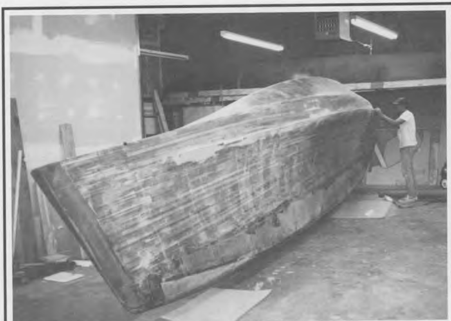
Hull now rolled over, and beginning to glass (carbon fiber in Mike's case) the outside